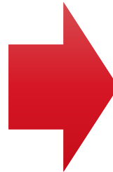
After PET Tray