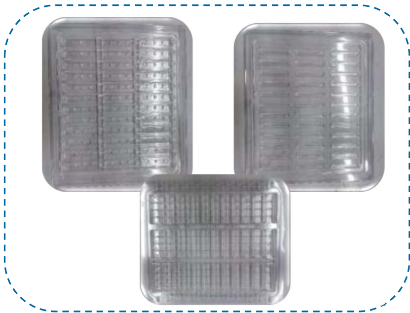
Before PVC Tray

To change the Soft Tray material from PVC to PET and some customer do not use PVC in packaging material to respond to the “the Packaging regulation” from customer.